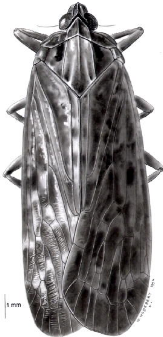
Fig. 1. Emeljanocarinus gargantua gen. et sp.n., habitus. Рис. 1. Emeljanocarinus gargantua gen. et sp.n., внешний вид.

and Acocarinus , for which only females were known. The following new taxa is also described only from females. However male are now known for the other Mycarini taxa and will be described in the Achilidae Fauna of Madagascar in preparation.